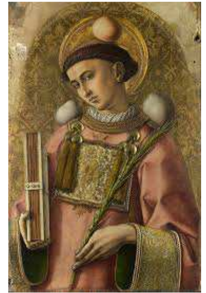
聖斯德望 St. Stephen by Carlo Crivelli

從“宗徒大事錄”第十九到二十章的記載，我們知道保祿又有第三次傳教之旅。這次旅行所拜訪的也是近東和歐洲地區的教會團體。保祿還有第四次傳教旅行，不過這一次不出於他自願，因為他是以囚犯的身份被押往羅馬受審。