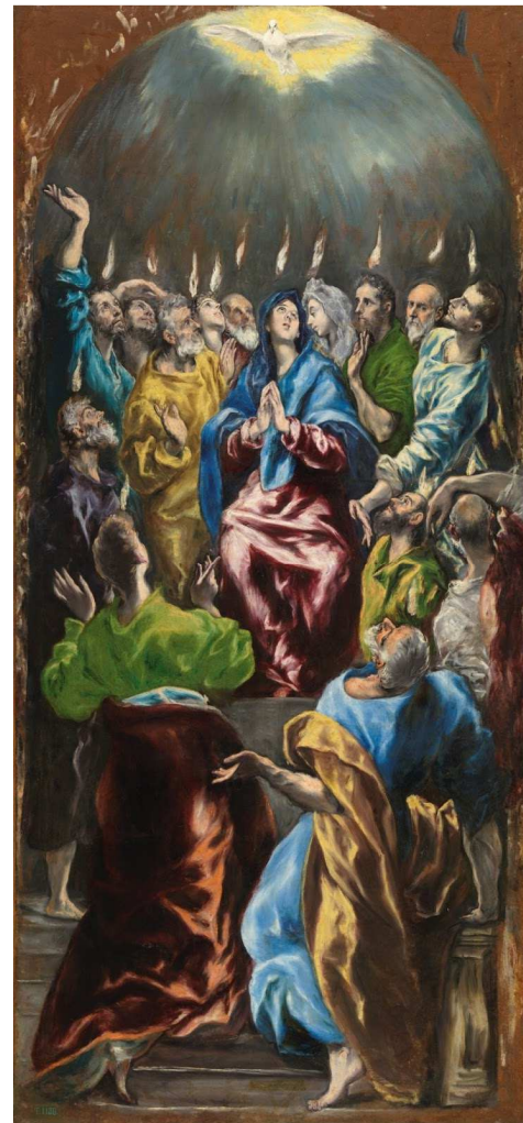
El Greco: Pentecost (1600)

宗徒們所選出的七位執事，他們有個領導人名叫斯德望，很有信德，也很有口才，能行大奇蹟，許多信奉舊教的人不喜歡他，常跟他辯論，但總敵不過他，他們于是找了一些人麻煩他，控告他，把他送到公議會對質。斯德望于是慷慨激昂地把猶太民族歷史的來龍去脈述說了一遍，譴責猶太人口是心非，不遵守天主的誠命，迫害預言默西亞要來的先知，更迫害先知曾經預言的默西亞，他強調天主所重視的是在心靈上敬拜天主，而非在人所建造的殿宇中作外表形式的禱告。